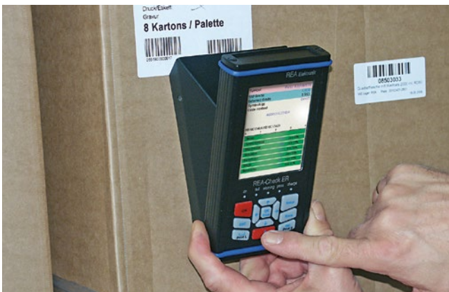
Flexible verification of barcodes on site