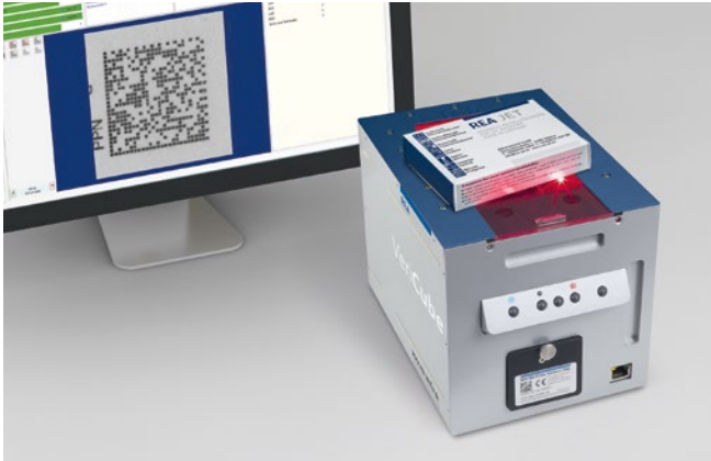
Verification of Data Matrix codes on product packaging