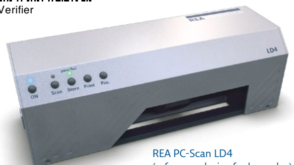
REA PC-Scan LD4 (reference device for barcodes)