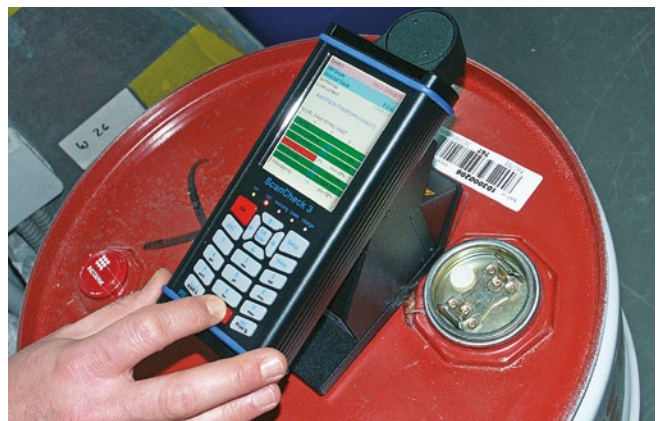
Verification of barcodes on metal drums