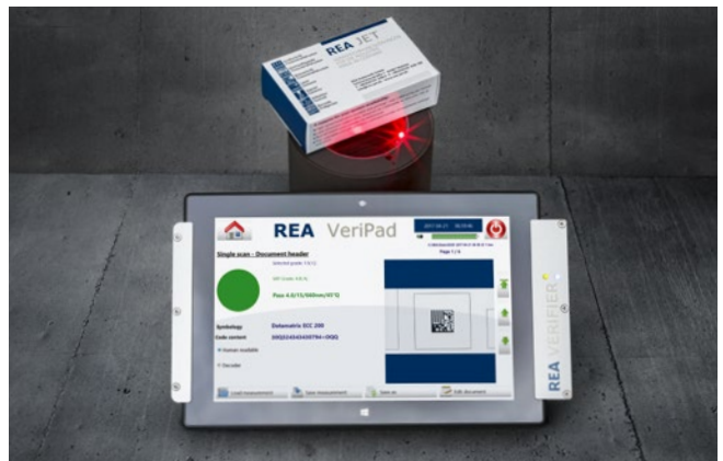
Mobile verification of 1D and 2D codes