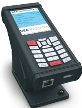
REA ScanCheck 3 (universal, for barcodes, mobile)