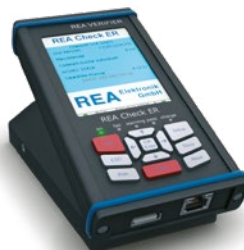
REA Check ER (compact, for barcodes, mobile)