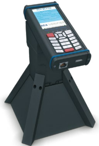
REA MLV-2D (for 2D codes and barcodes)