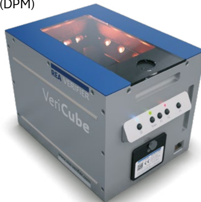
REA VeriCube (for 2D codes and barcodes, ready for 21 CFR Part 11)