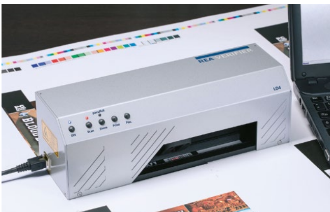
Measuring of barcodes on print sample sheets