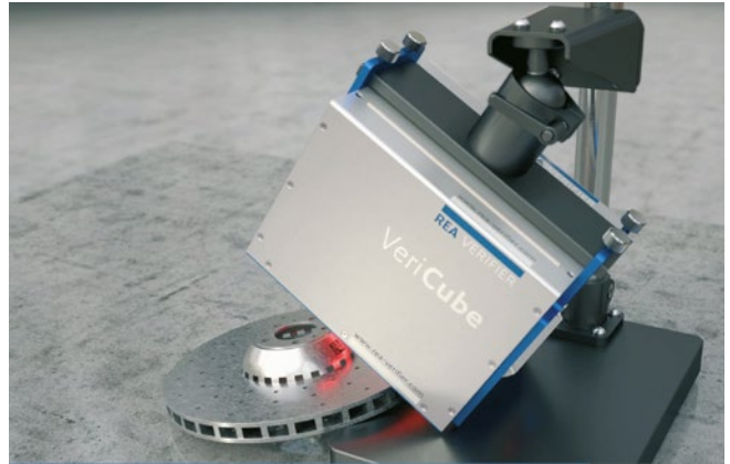
Stand solution for code verification on 3D objects