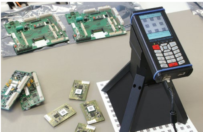
Verification of Data Matrix codes on label sheets