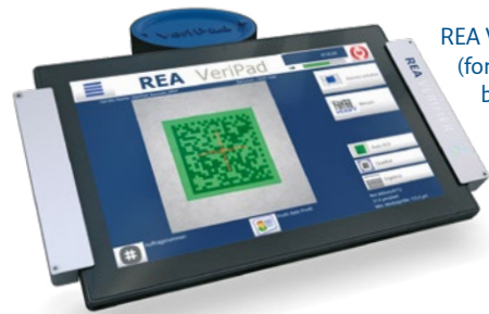
REA VeriPad (for 2D codes and barcodes, mobile)